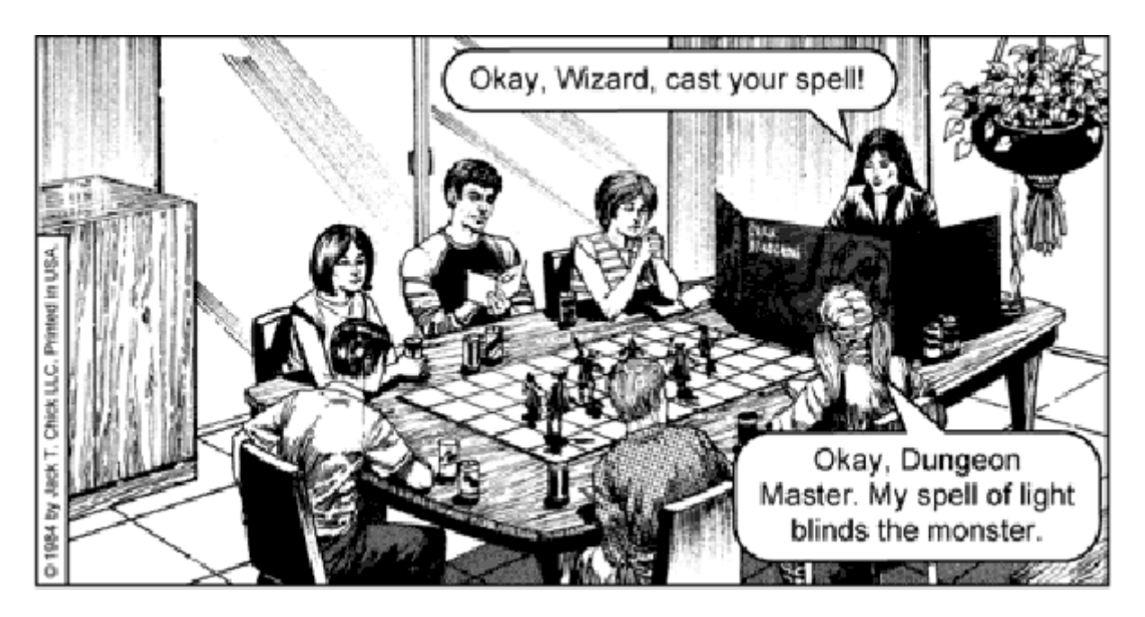
A battle between light and darkness in a stark urban fantasy milieu.

Preparation: Have every player read the original "Dark Dungeons" [https://www.chick.com/reading/tracts/0046/0046_01.asp] to start with (it's not long), then continue with the following: